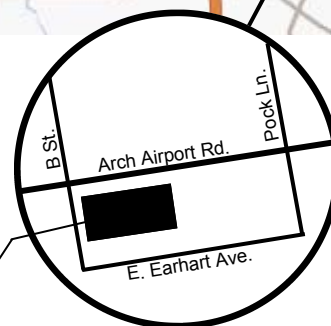
Robert J. Cabral Agricultural Ctr.